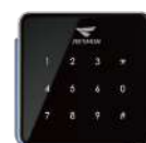
JSMJD18-02 Card&Password Reader