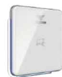
JSMJD18-01 Card Reader